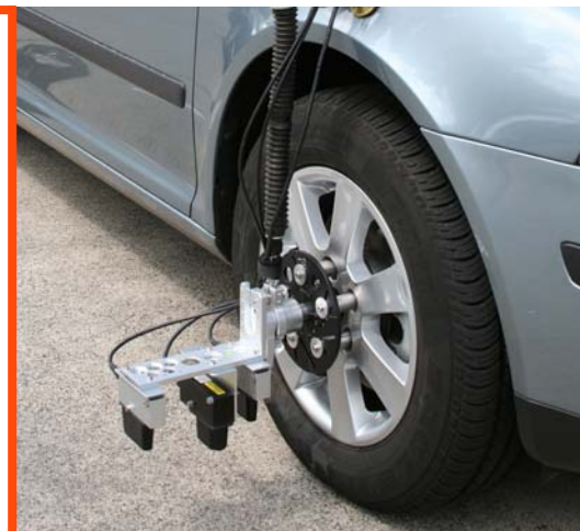
DCA System with SFII Sensor

** optional, with Wheel Pulse Transducer Art.no. 11355