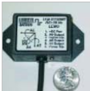
Gyro & Acceleration sensor